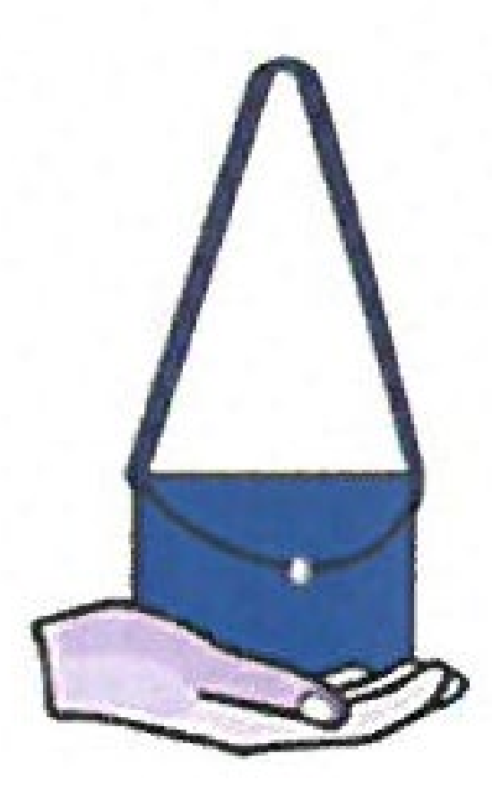
Clutch With Shoulder Strap No Larger than 4.5"x6.5"