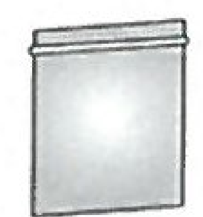
1 Gallon Plastic Freezer Bag