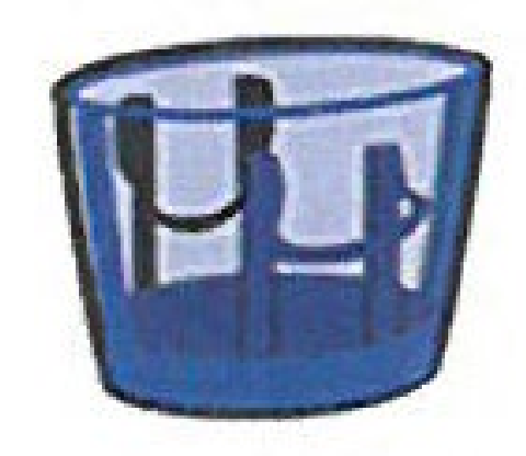
Tinted Plastic Bag