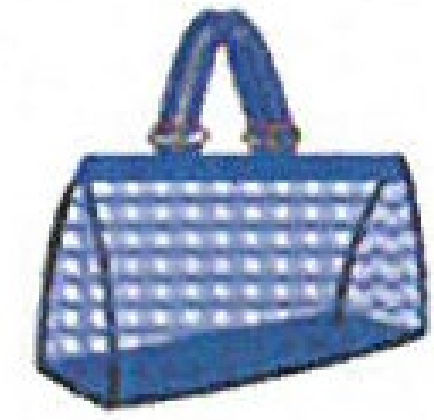
Printed Pattern Plastic Bag