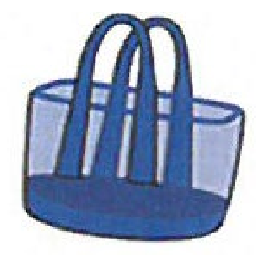
Oversized Tote Bag