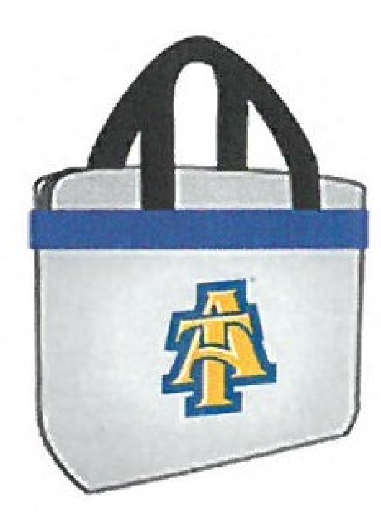
12"x12" Clear Plastic Bag