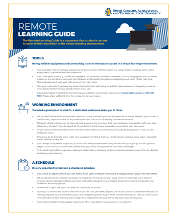
Click on image above to view the Remote Learning Guide