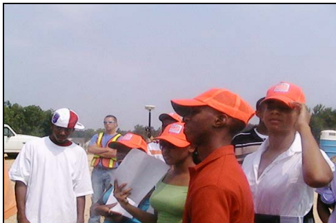
2007 STI Participants at construction site

Upon successful completion of the STI, participants will be awarded certificates acknowledging their participation.