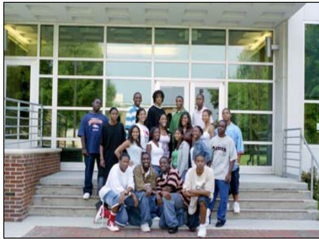
STI Class of 2006

The Summer High School Transportation Institute (STI) is a unique concept that creates an awareness of the attractive career choices and opportunities existing within the transportation industry. Analysts have predicted that the transportation industry will experience a shortage in qualified professionals during the 21 st century. As a result, the U.S. Department of Transportation, state and local transportation agencies, and the University's Transportation Institute have placed a