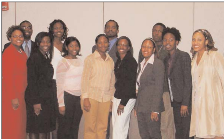
Current McNair Scholars at the 2004 McNair Induction Ceremony.

After the exams were over, we took another trip to Accra. Our second stay in Accra was our opportunity to be tourists. During that time I bought gifts for my family and memorabilia for myself. I was sad when my stay had to come to an end. In the beginning, I was not sure if I would have a good time in a different country, especially a country in Africa. Through all of the media propaganda and the stereotypes, I did not think that Ghana would be as modern as it really is. I am glad that I decided to take that chance and see what the country was really about. From my trip, I can share with my classmates and others what the true Ghana is and smash a lot of the stereotypes that many Americans have about African life.