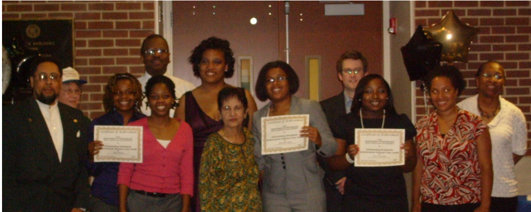
Psychology Department faculty members recognize graduating seniors with outstanding academic achievement at the banquet organized by Psi Chi and the Psychology Club

Following dinner, the students honored the faculty and staff of the department with certificates of appreciation as well as the much-anticipated "faculty superlatives" (see next page).